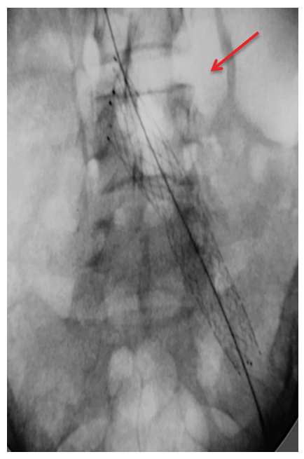
The Sinus-Obliquus iliac venous stent, Markers for correct rotational positioning (Red arrow).

Citation: Reis PEO (2017) New Generation Venous Stent to Treat May-Thurner Syndrome. J Vasc Endovasc Surg. Vol. 2 No. 3:23