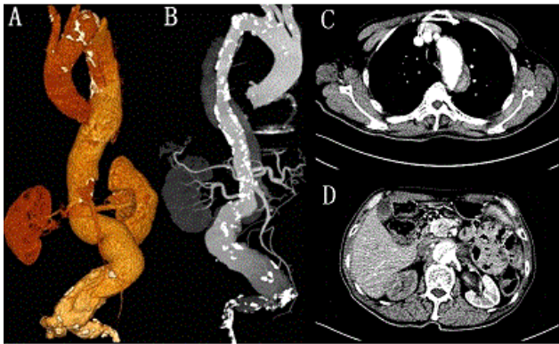
Figure 1: Preoperative computed tomography reconstructed image of dissection, right renal atrophy, celiac trunk, superior mesenteric artery and left renal artery emerged from true lumen.