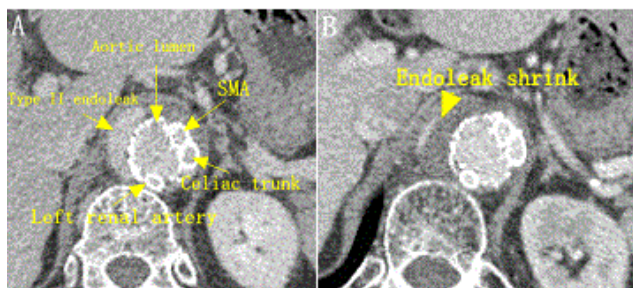
Figure 4: A) Postoperative CT angiography transverse reconstruction: the arrows indicate the chimney grafts in position in superior mesenteric artery (SMA), celiac trunk and left renal artery and type II endoleak and aortic lumen (1-week follow-up). B) Show the shrink of type II endoleak in 10-month follow-up.

One week's follow-up with CTA showed patency of the grafts and a persistent type II endoleak without deterioration ( Figure 4A ). Ten-month's follow-up also showed adequate patency of all three branches, and the thrombosis in the descending false lumen as well as the shrink of the type II endoleak ( Figure 4B ).