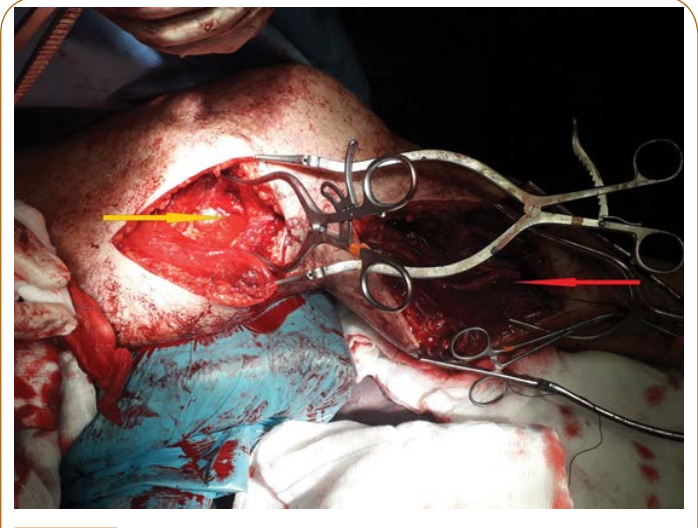
Figure 4 Femoral to distal posterior tibial bypass with a reversed saphenous vein graft (yellow arrow proximal anastomosis, red arrow distal anastomosis).