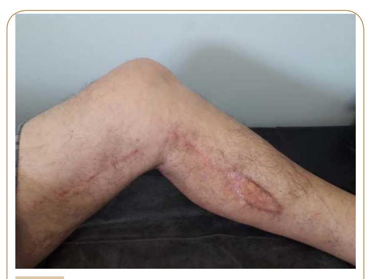
Figure 7 Completely healed wounds.