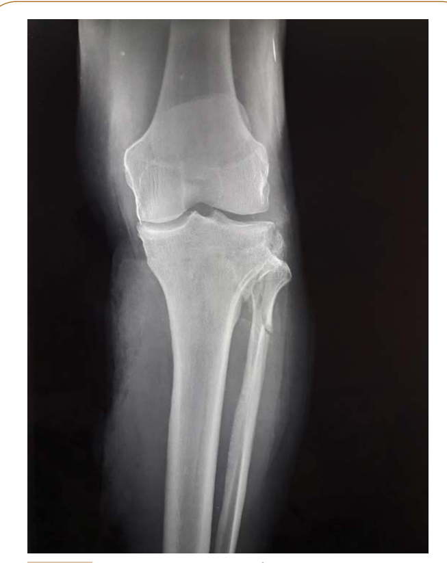
Figure 1 Radiographic image of bullet entry point and its trajectory.