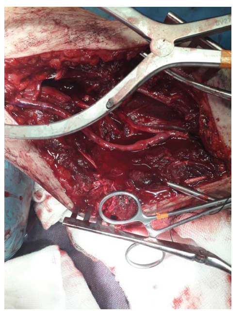
Figure 5Better view of calf incision and distal anastomosis.Note vein graft marked in blue lines.

by high-velocity weapons (70% to 80%), followed by stab wounds (10% to 15%) and blunt trauma (5% to 10%) [1-3].